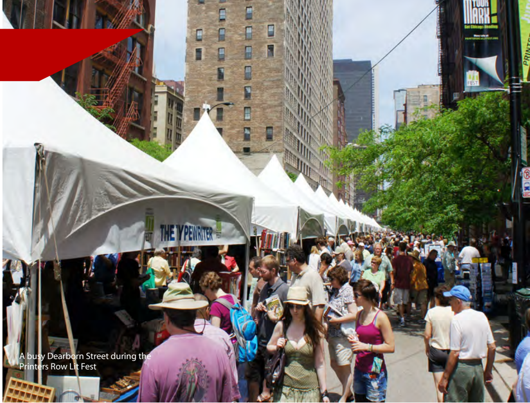
A busy Dearborn Street during the Printers Row Lit Fest