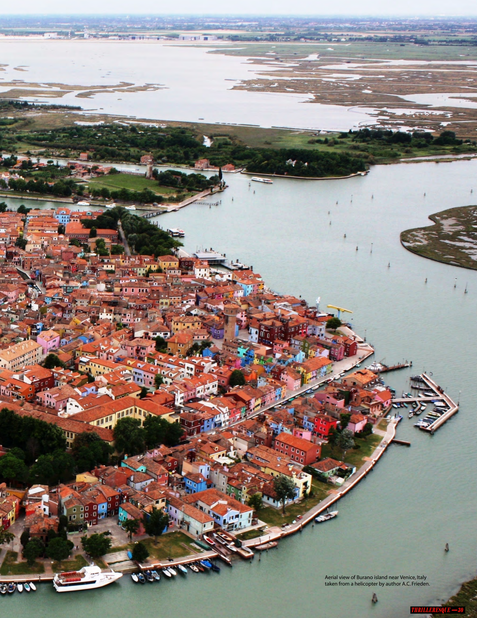
Aerial view of Burano island near Venice, Italy taken from a helicopter.